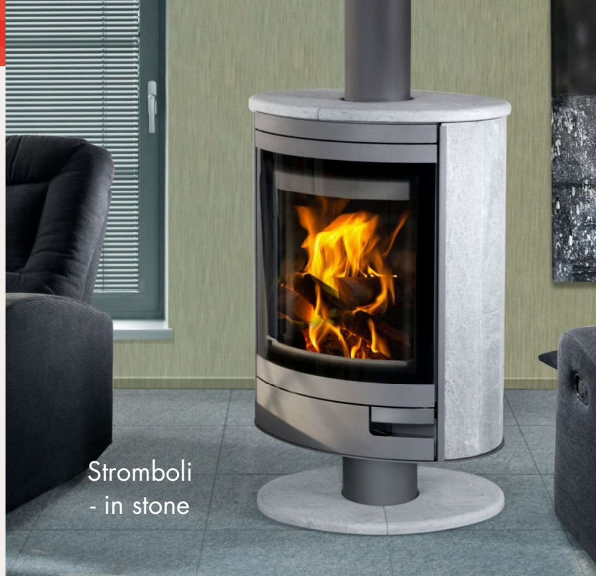
Stromboli - in stone

Cladding options include steel, ceramic tile, or natural stone. The Stromboli heats up to 38,000 BTUs; about 1,600 square feet.