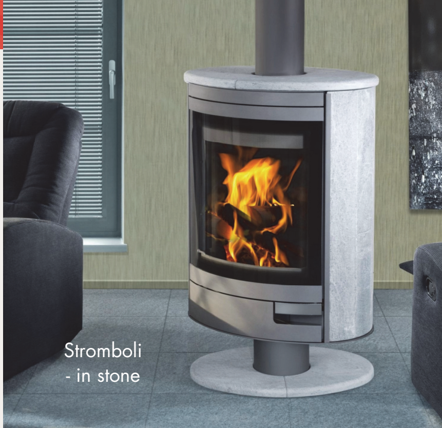
Stromboli - in stone