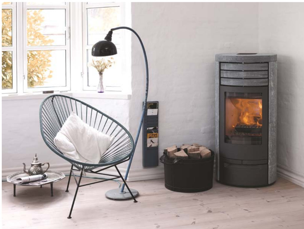
The Stove with Many Options...

Wittus Inc. P.O. Box 120, Pound Ridge NY 10576 T.914.764.5679 F.914.764.0465